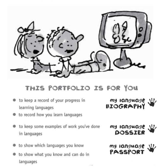
Figure 4.3: Example of an ELP developed by CILT (UK), the National Centre for Languages<sup>3</sup>

The language biography contains 'I can' descriptors that are linked to the CEFR proficiency levels. These descriptors enable the learner to 'identify learning goals and assess learning outcomes' (Little, 2011b, p. 9). The scales for these descriptors are based on the 'can do' CEFR proficiency levels A1–C2 as described above and categorised by communicative activity. Table 4.2 shows a section of the self-assessment grid with the 'I can' statements.