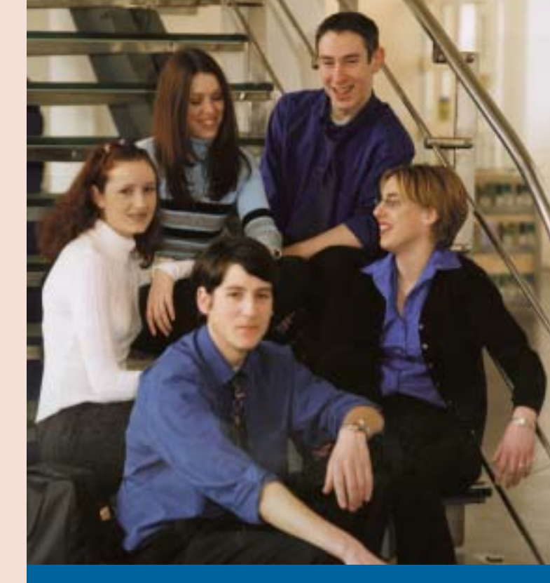
Leaving Certificate Applied

Annual surveys of Leaving Certificate Applied graduates show that on average 89% of these graduates are employed or attending further education courses in the year immediately following completion of the course.