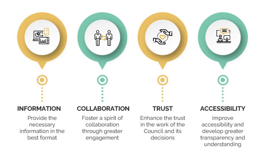
Figure 1: PILLARS OF COMMUNICATION

These four pillars will require particular strategic tasks over the course of the strategy. This involves programmatic change and will require the involvement of many different elements of the organisation. To fully implement these four pillars will require the strategy to be led and organised from a single point. This can ensure that results are achieved and that the changes have the support and understanding across various teams. The strategic tasks identified under this change are: