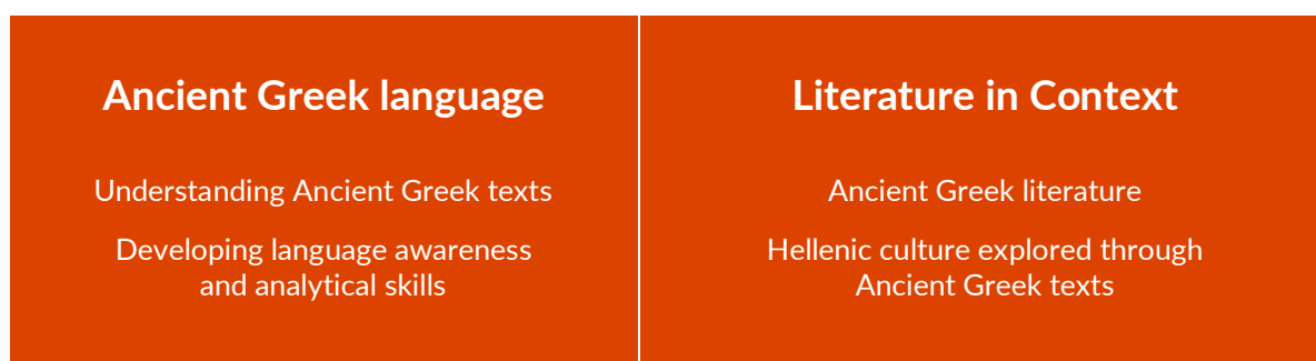
Figure 3 Strand structure in the Ancient Greek specification

The Leaving Certificate Ancient Greek specification is presented in two strands which each have two core elements: