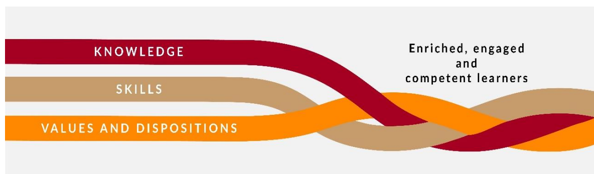
Figure 1 The components of key competencies and their desired impact

Senior cycle helps students to become more engaged, enriched and competent, as they further develop their knowledge, skills, values and dispositions in an integrated way.